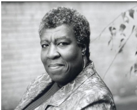
Octavia Butler, Author

Are you an avid reader? Do you enjoy discussing books with your friends? Why not enjoy our next book club session with Octavia Butler's classic "Kindred"?